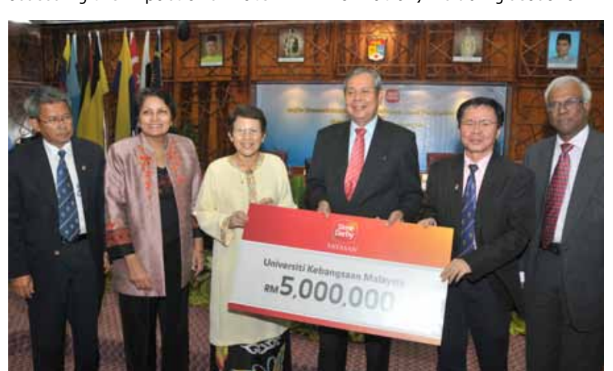
YSD Council Members and the representatives from UKM with the mock cheque during the launch of the UKM-YSD Chair for Climate Change.

climate forecasts, all of which would be important and useful for the planning and management of Sime Darby's plantation operations. The same is true for projects to examine the impact of climate change on ecosystems in palm oil plantations or to develop ecological approaches to pest control. Thus, support for the Chair would result in knowledge and technologies which would enable Sime Darby to become more competitive while at the same time minimizing the impact of its business activities on the environment.