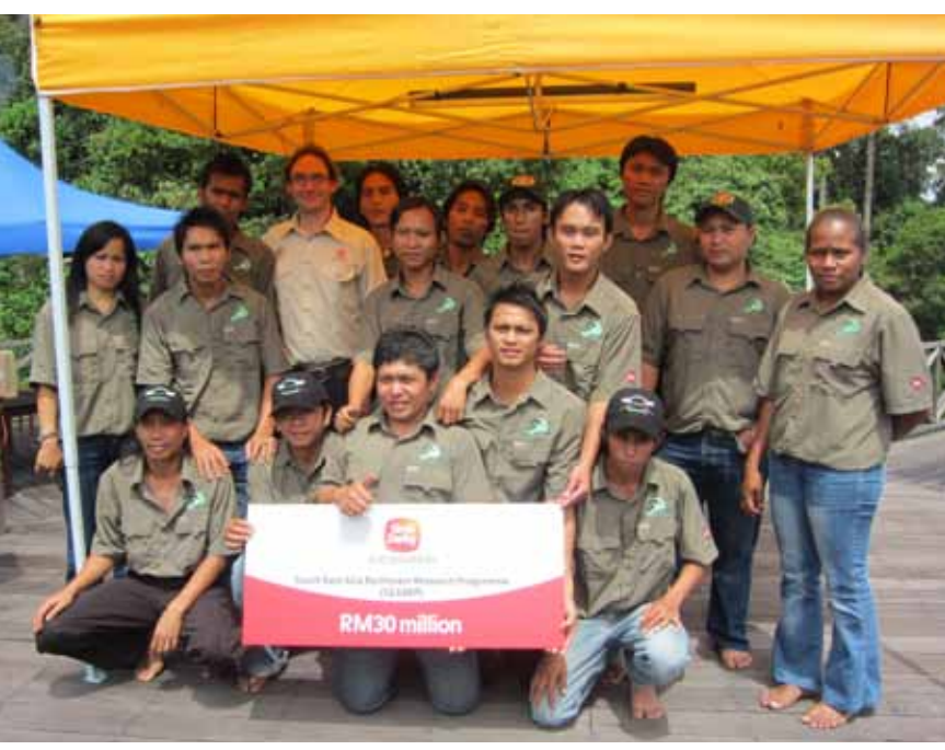
The researchers and staff of the SAFE project.