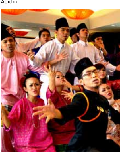
A dramatic preview of a performance that was held during the festival.