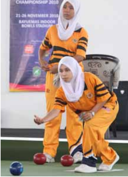
The Malaysian team in action during the Championship.