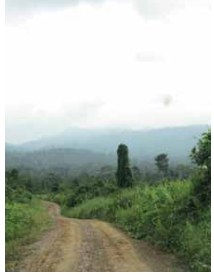
View of the highly degraded Northern Ulu Segama Forest Reserve today, due to excessive logging in the mid 90s.