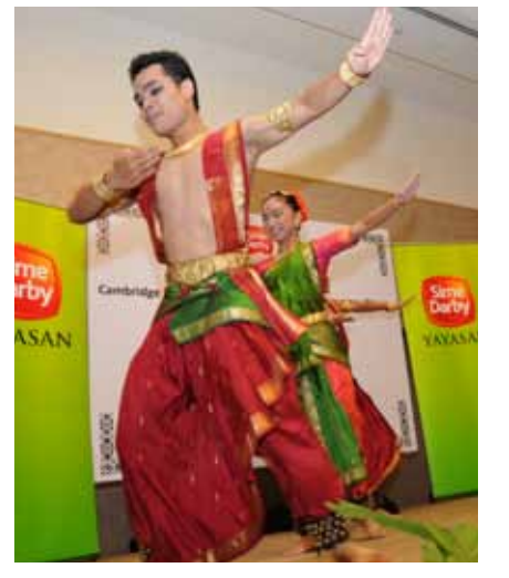
A traditional Indian dance performed skillfully by ASWARA dancers.