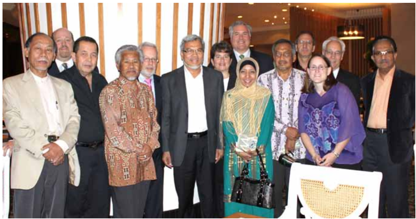
The Ohio University delegation meeting with former Tun Razak Chairholders in Kuala Lumpur in 2010.