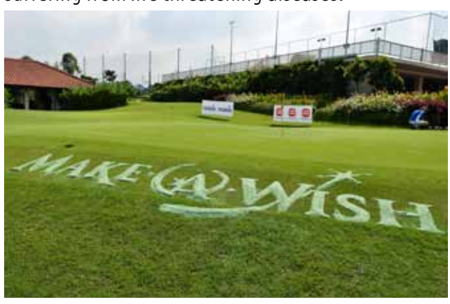
The charity golf tournament under the Make-A-Wish Foundation was held at Kuala Lumpur Golf and Country Club (KLGCC).

YSD contributed RM15,000 as the Gold sponsor for this charity golf tournament. The funds donated will be used to fulfill the wishes of terminally ill children suffering from life threatening diseases.