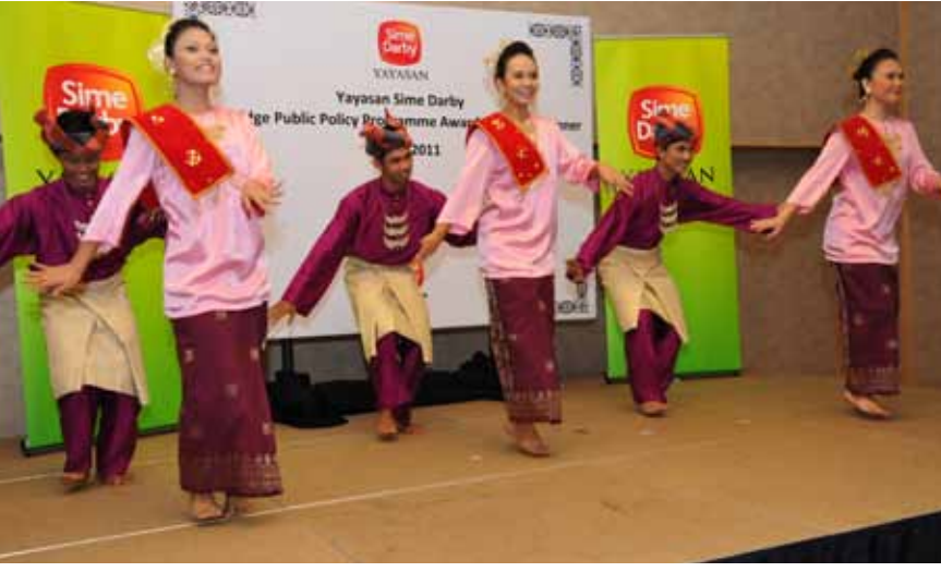
ASWARA dancers performing a traditional Malay dance.