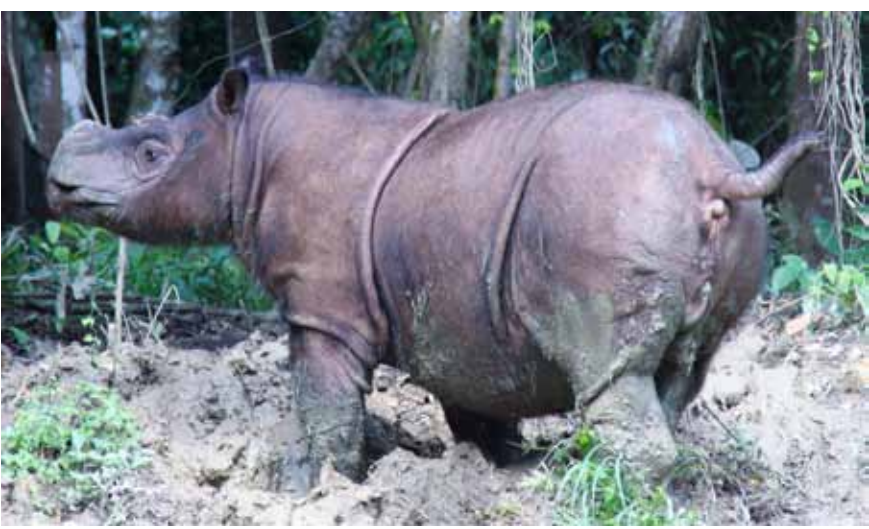
Tam, YSD's adopted Bornean Sumatran Rhino, safe in his sanctuary.