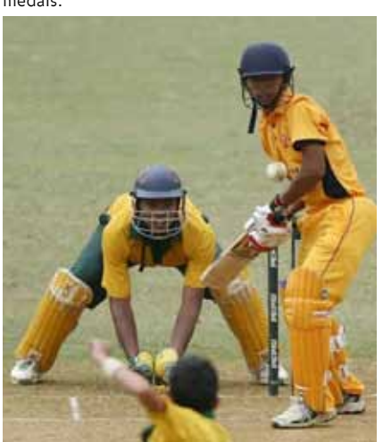
Senior team in action during the IX International Malay Cricket Tournament 2010.