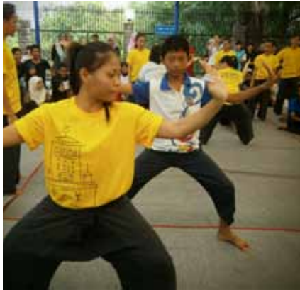
Learning by example, a young boy taking pointers from an ASWARA dancer during the workshop.