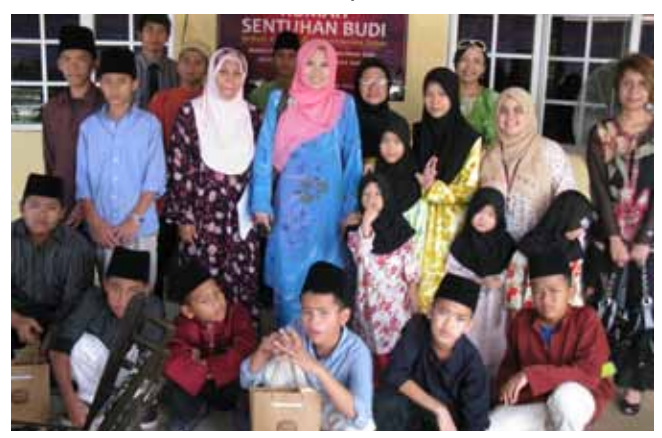
YSD staff with the residents of Rumah Sentuhan Budi.

YSD brought smiles to the faces of the orphans at Rumah Sentuhan Budi when we donated RM1,250 worth of clothes for Hari Raya.