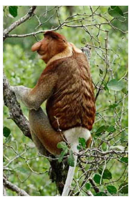
This arboreal species is endangered as they face a single major threat - their habitats are areas which tend to be among the most colonised, farmed, industrialised and least protected by man.