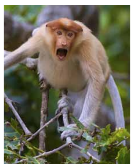
The Proboscis Monkey has partially webbed hands and feet to allow for water mobility.