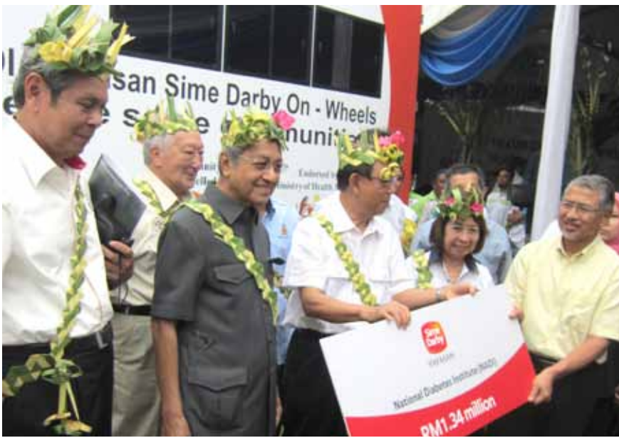
YSD Council Members with Tun Mahathir Mohamad at the launch of NADI-YSD On-Wheels programme.