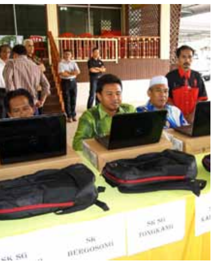
Representatives from the schools testing out their respective laptops.