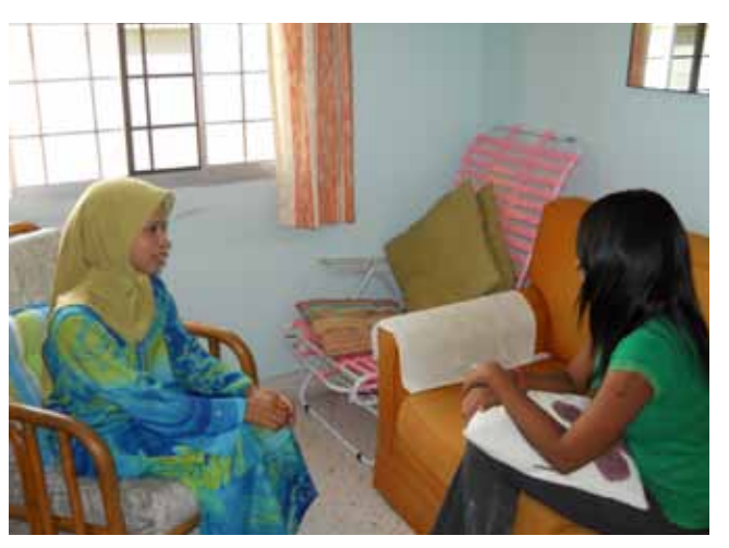
A refugee receiving guidance from a professional counselor at the centre.