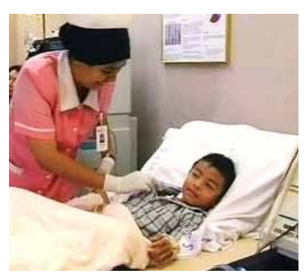
A young leukemia patient being treated by a nurse at SDMC.