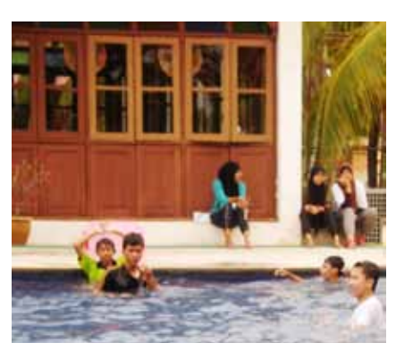
STEP programme participants playing water polo as their recreational activity.