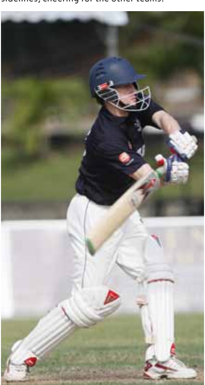
A cricket player in action during the 4th International Youth Cricket Festival 2010 at Royal Selangor Club, Bukit Kiara.