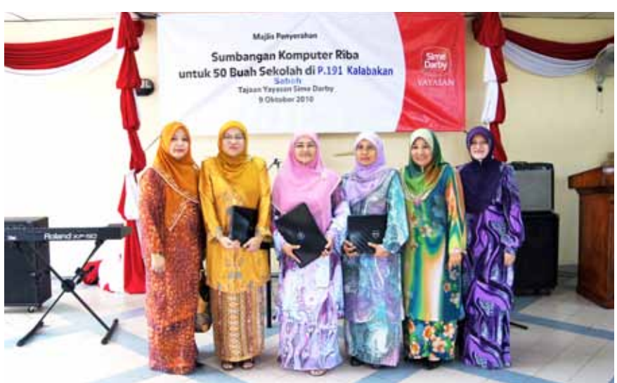
Teachers with their newly acquired laptops.

due to poor accessibility to current communication tools and equipments such as laptops and internet connection. With YSD's support, latest information from the relevant ministries and support offices of Malaysia will be within reach and be useful for the headmaster/ principal and administration staff, who will also be able to keep their teachers and students abreast of up-to-date developments and information that is relevant to their fields of study.