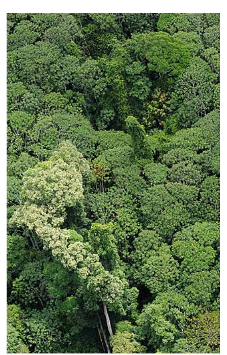
An aerial view of the secondary mixed forest that can be found on-site.