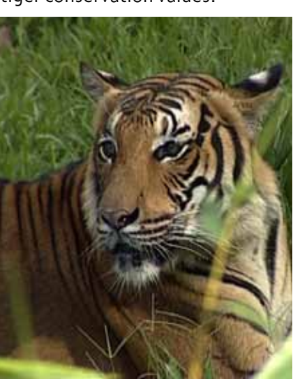
It is estimated that there are only 500 Malayan Tigers remaining in Peninsular Malaysia from 3.000 back in the 1950s.

YSD, Sime Darby Plantation and WWF-Malaysia signed an agreement to carry out a study aimed at assessing selected Sime Darby Plantation estate, which is the Sungai Dingin Estate in Kedah, for the purpose of formulating recommendations in improving sustainable plantation management. The study aims to analyse information on the effects of current activities and operations carried out in oil palm plantations on the wildlife and environment; determine the presence of the Malayan Tiger (Panthera tigris jacksoni) and assess its conservation status in and around the selected estate through monitoring of the animal, its habitat and the population of its prey, while determining the levels of human-wildlife conflict and poaching in the plantations, as well as identify the water courses and riparian areas within the estate that contain, or have the potential to contain, significant tiger conservation values.