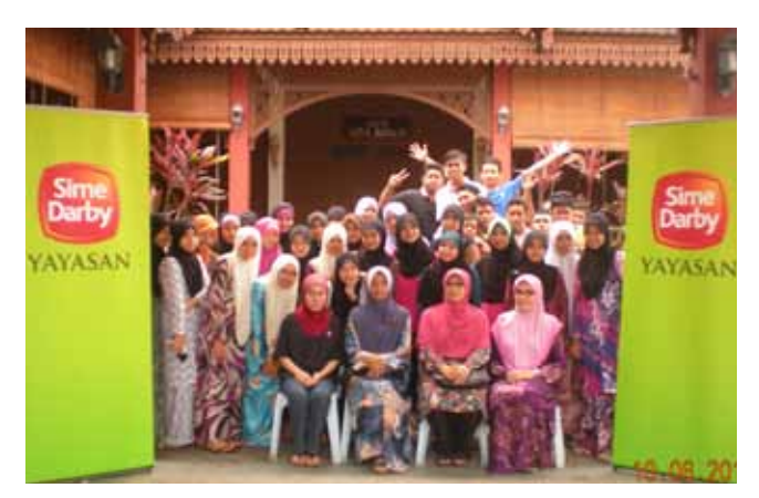
Students attending "Kem Pecutan Prestasi PMR & SPM 2011" from 6 to 10 June 2011.

The YSD School Excellence Twinning Programme (STEP) is another programme which is aimed at creating and nurturing good school culture and an environment that promotes high performance and academic excellence. The pioneer programme was launched on 2 April 2011 with potential students and teachers from the two rural schools attending a oneweek attachment at one of the top Sekolah Berprestasi Tinggi in Malaysia.