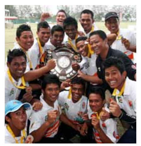
Athletes of the Malay Cricket Association of Malaysia posing proudly with their trophy and medals.

and Mixed Pairs Categories. The support for the Malaysian Lawn Bowls Federation's 5th Asia Pacific Merdeka Singles & Mixed Pairs Championship 2010 is proof of YSD's commitment towards providing opportunities to youth and boosting their development in the area of sports, which would also enhance their overall development and increase their chances of future success in achieving their aspirations.