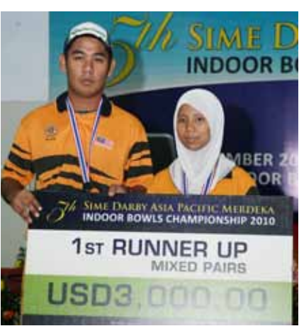
The Malaysian team succeeded in winning the Silver Medal of the Mixed Pairs category.